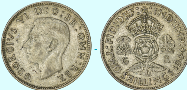
Lot 3: 1944 Two Shillings, KM-855, Great Britain