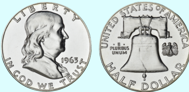
Lot 2: 1963 Franklin Half Dollar, Proof