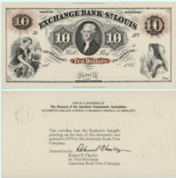
Lot 1: 1979 American Bank Note Company, Intaglio Print